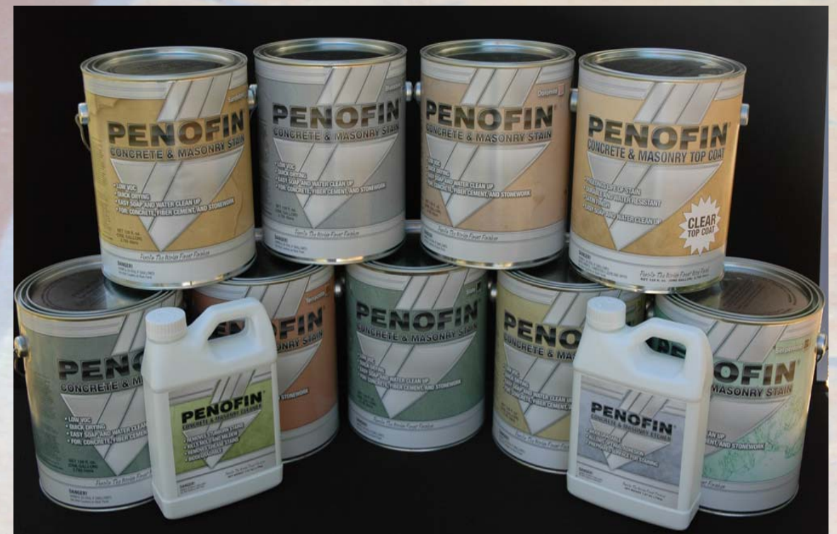
A palette of eight natural stone hues